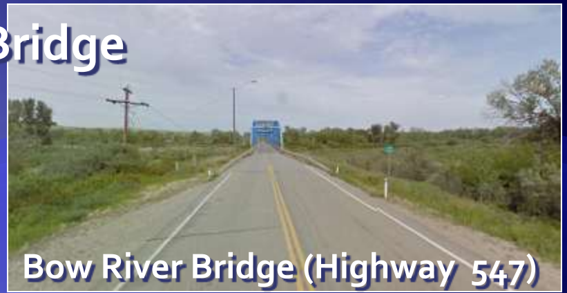
Bow River Bridge (Highway 547)