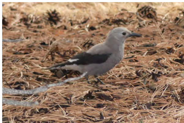
Clark's Nutcracker by Howard Heffler

Reminder to show your Nature Calgary membership card and receive a discount! The Wild Bird Store and Wild Bird Centre (located inside Fairplay Pet Supply) offer a 10% discount and Golden Acre Home and Garden Centre offer members a 15% discount.