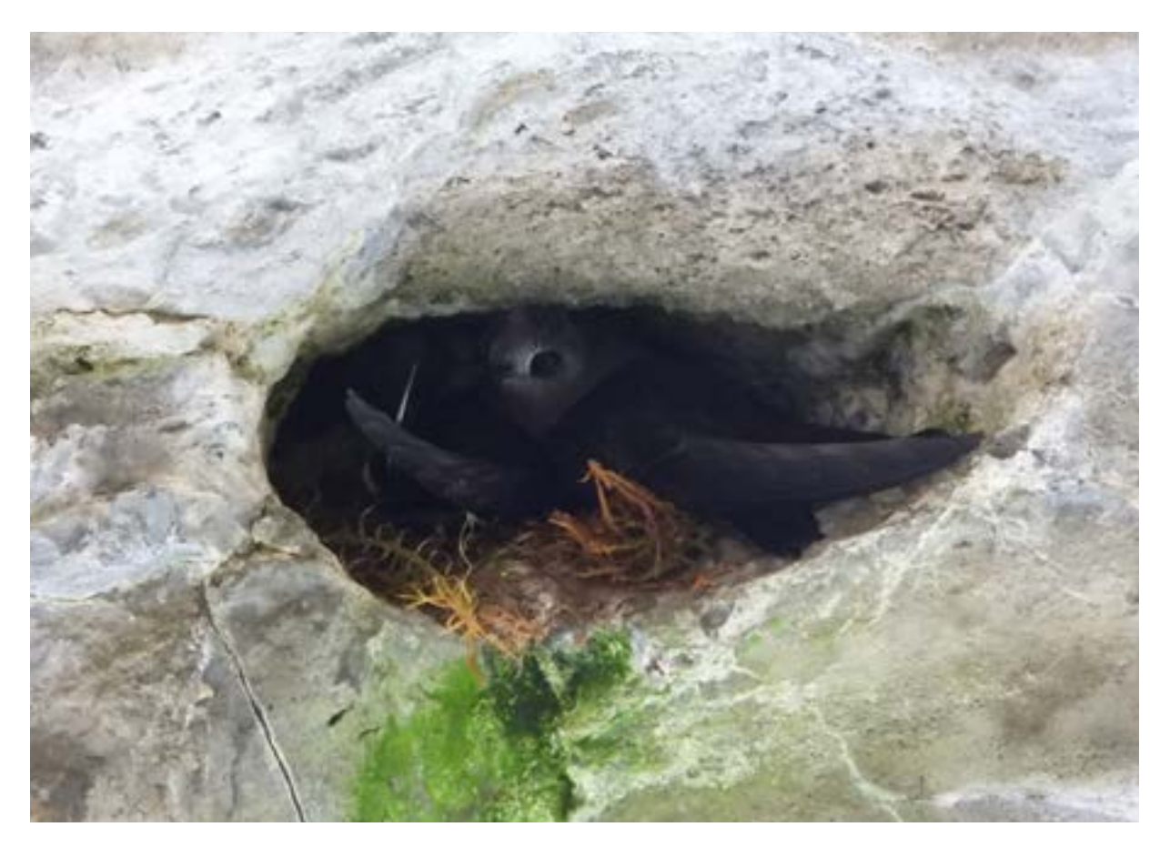
Black Swifts

Presentation: Black Swifts (Cypseloides niger borealis) are the largest swifts in North America and the only subspecies to occur in Canada. This high flying aerial insectivore is the ultimate habitat specialist seeking commanding views of plunging waterfalls to nest beside. The species was listed as Endangered in Canada in 2019 due to steep declines in the Canadian population. In Banff National Park, Black Swifts have been observed nesting in the park and on the eastern edge of their range since 1919! Researchers are implementing an array of tools to better understand these cryptic creatures who spend most of their lives on the wing! Come find out how Black Swifts are doing in Johnston Canyon and how creativity is key to studying them.