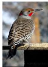
Northern Flicker