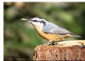
Red-breasted Nuthatch