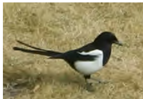
Black-billed Magpie J. McFaul