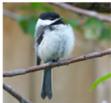
Black-capped Chickadee S. Jordan- McLachlan

Bird Friendly Calgary wishes to announce that the results of the month long contest to nominate the official bird of Calgary are in. A total of 36,616 votes were cast for the five candidate birds: